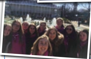
All of the group going on the same ride 4 times in a row at Tivoli gardens, the ride was for age 4 plus.